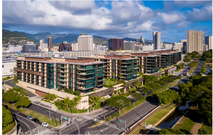
Park Lane Ala Moana project completed

Award Entry Submitted by: Akira Usami, CEMCO