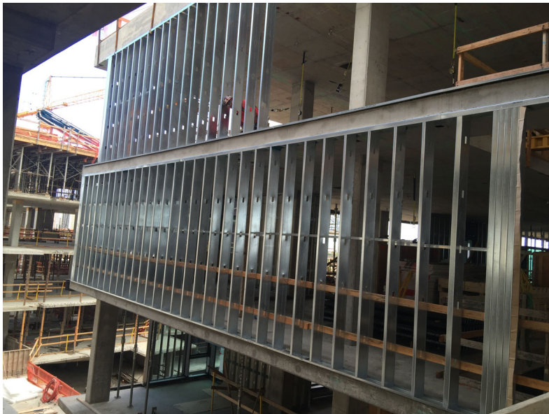
Slab discrepancy framed

A unique design challenge occurred along the north wall of Building 2. The concrete contractor incorrectly poured the slab edge on Levels 6 to 8, which required Group Builders, Inc. to come up with a solution to maintain the original look. Adding to the complexity was the 50-foot-length of wall which had to be furred out to a taper on one end. The additional framing had to be built out in a triangular shape instead of a rectangle. Group Builders Inc. and CEMCO Engineering worked closely together to create a cost-effective solution for the client to keep the project moving on schedule.